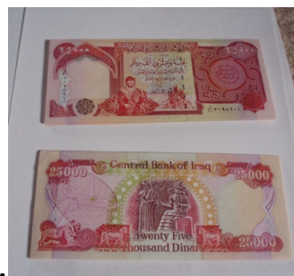
Front and back...