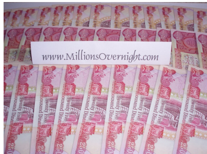
A million Dinars...

Just to let you know I am a person who puts his money where his mouth is. I took some pictures of my Millions for you to see. Click all three thumbnails to enlarge and view the pictures.